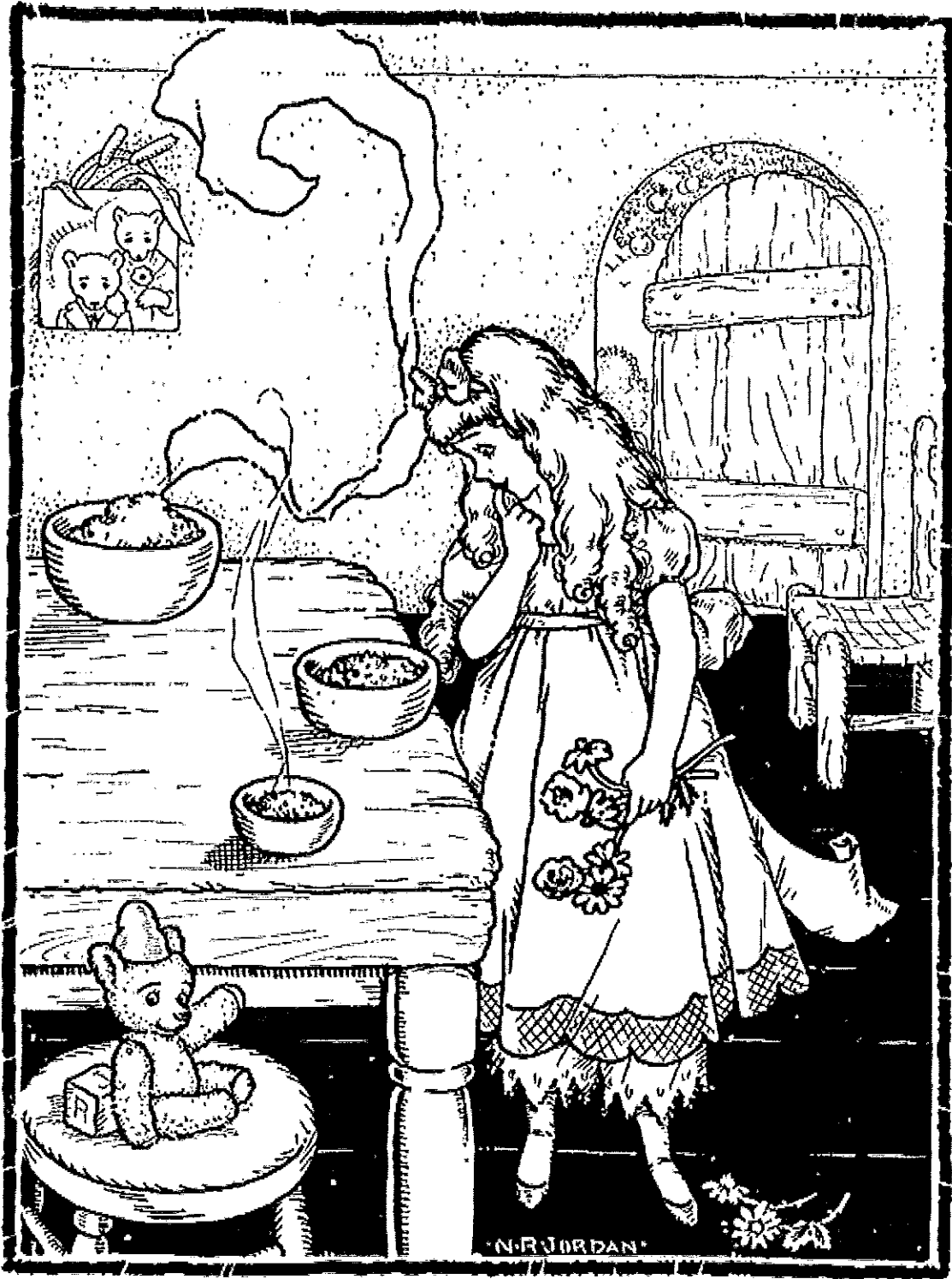
Goldilocks and the Three Bears